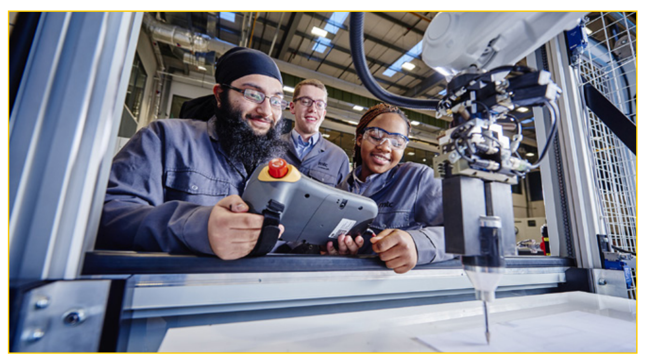
The Manufacturing Technology Centre (MTC) helps SMEs address practical, technical, and strategic challenges.