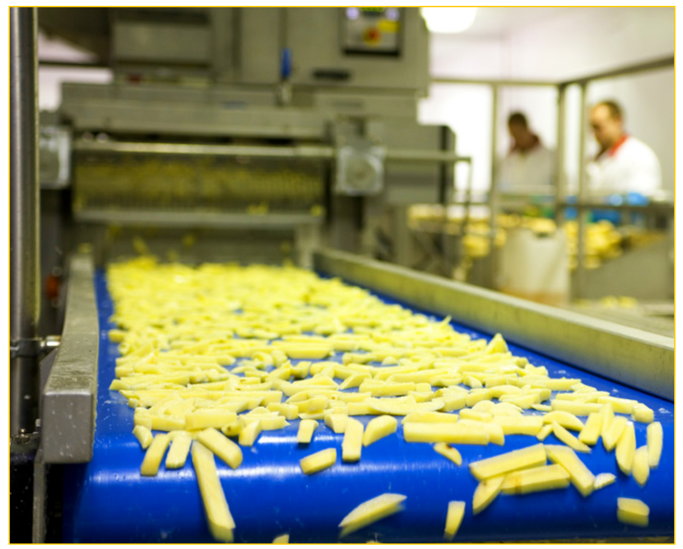
Flyde Fresh and Fabulous invested in a bespoke ERP system to improve product quality checks.

To learn more about data and system integration tools download our guide to using technology to overcome operational challenges.