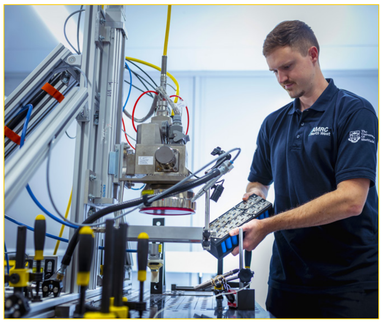
The AMRC's £20m North West R&D facility opened in 2022.

<u>AMRC North West</u>, based in Samlesbury, is part of the University of Sheffield Advanced Manufacturing Research Centre (AMRC), a cluster of world-class centres for innovation and research into advanced manufacturing technologies.