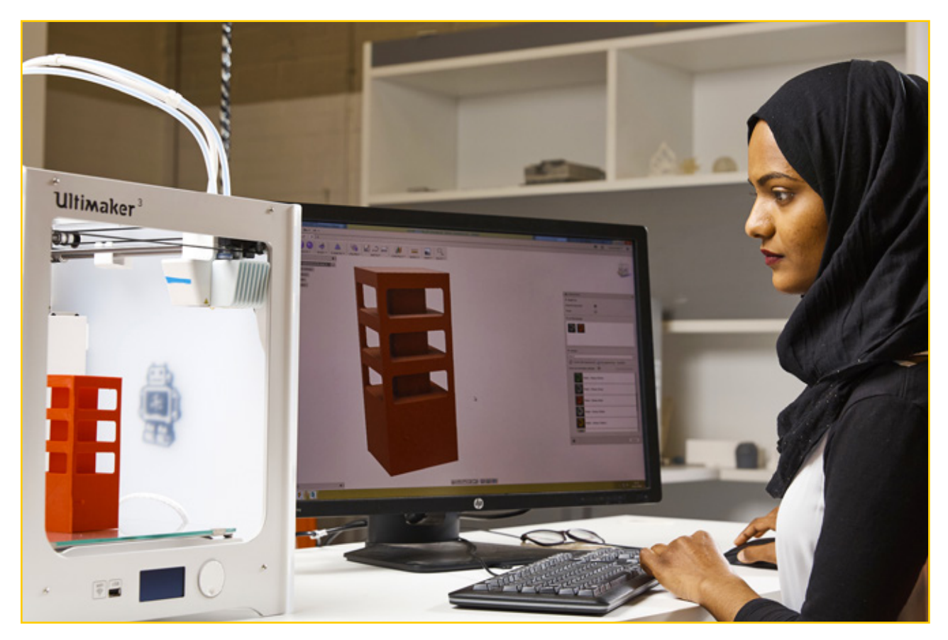
An undergraduate at Manchester Metropolitan's PrintCity facility.

<u>PrintCity</u> is a leading 3D printing facility based at Manchester Metropolitan University, focusing on teaching, research, knowledge exchange and outreach.