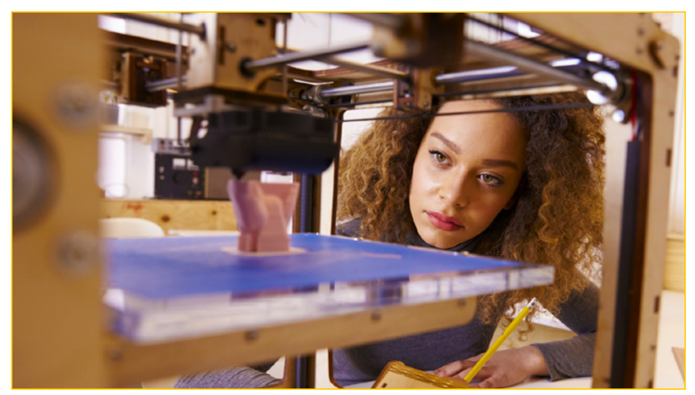
3D printing can transform manufacturing.

Adopting AM correctly needs effective planning and preparation. The Made Smarter team can give you an idea of costs and help determine the best applications for your needs. We can also introduce you to partners like PrintCity and ARMC NW who can work with you to perform small-scale trials.