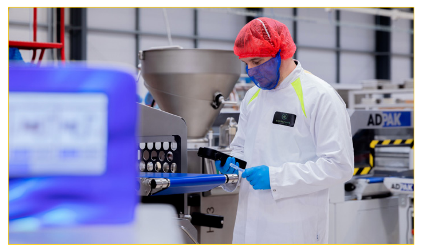
Nutree Life invested in bespoke automation to boost productivity.

To learn more about automation and read about more case studies visit our expert blog .